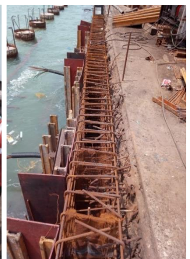
EXISTING BERTHS BEING STRENGTHENED, WIDENED & DEEPEMED