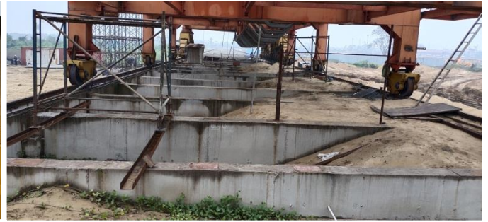
STACKER/RECLAIMER UNDER INSTALLATION