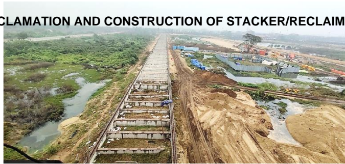
LAND RECLAMATION AND CONSTRUCTION OF STACKER/RECLAIMER TRACK